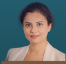
Dakshina Chandra Research Fellow