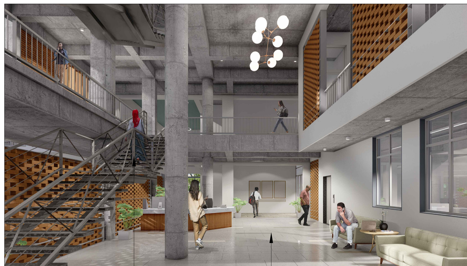
View F MS Staircase Entrance Lobby