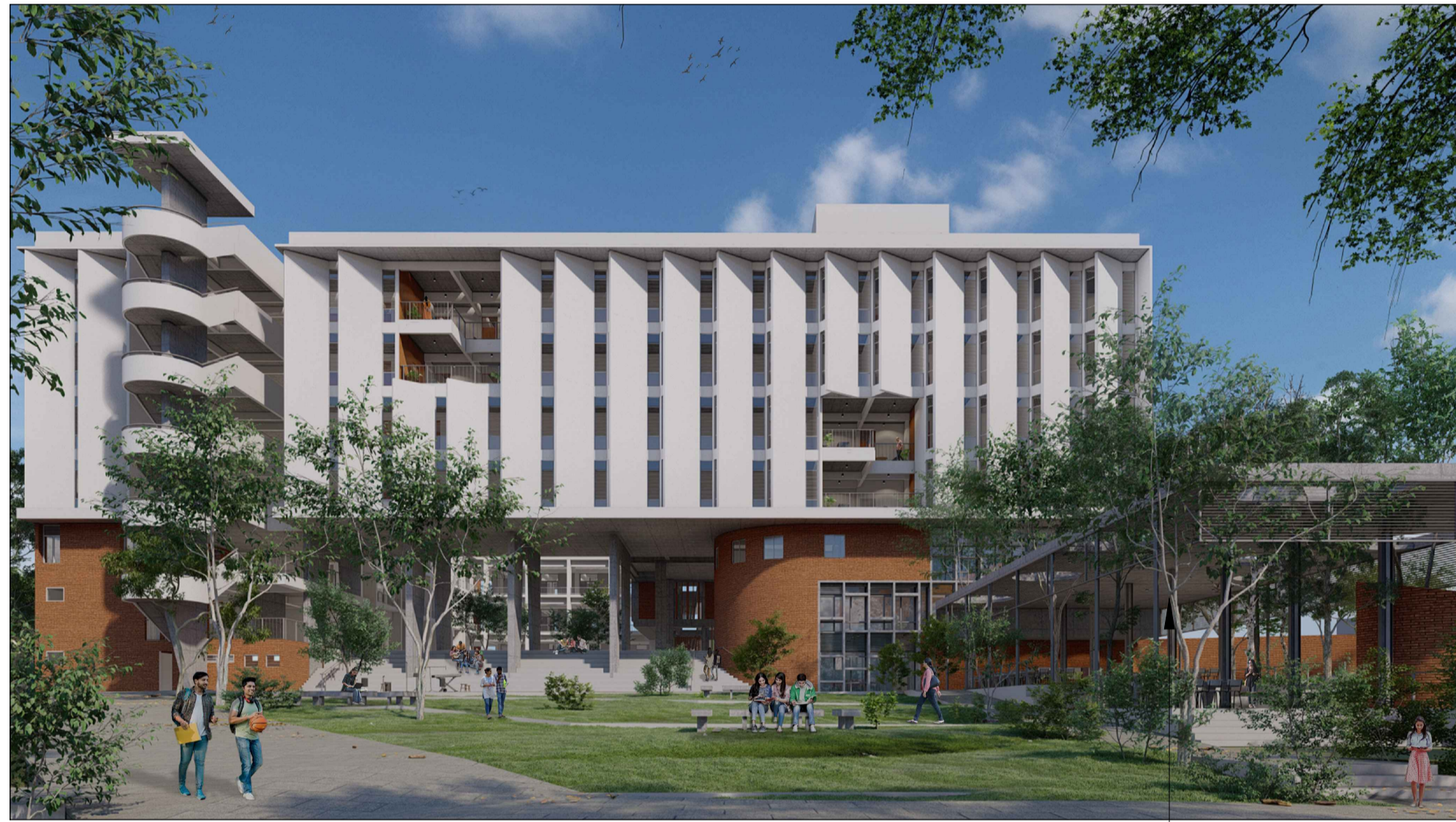
View B Outdoor Cafe