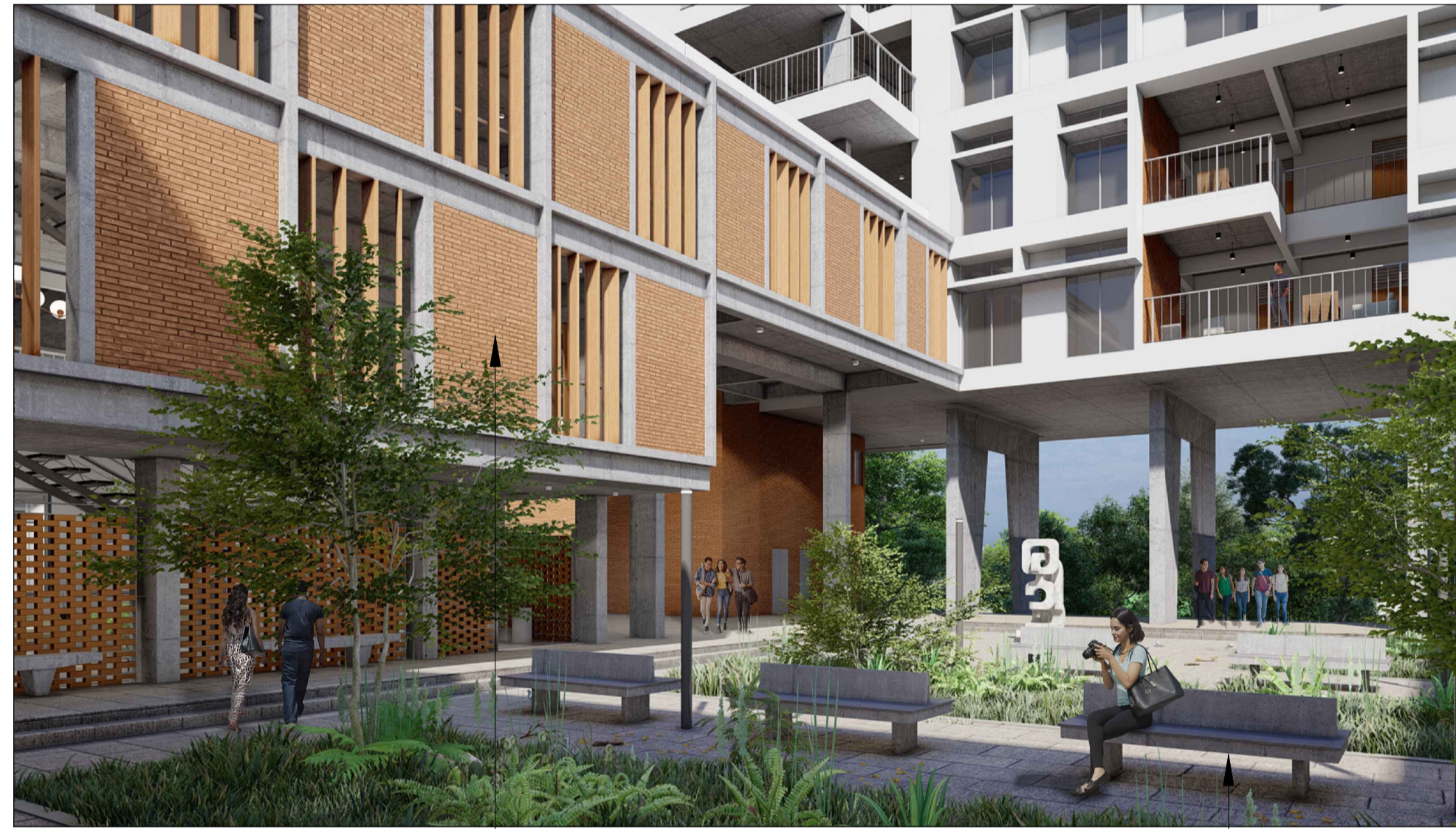
View E Entrance Lobby Courtyard