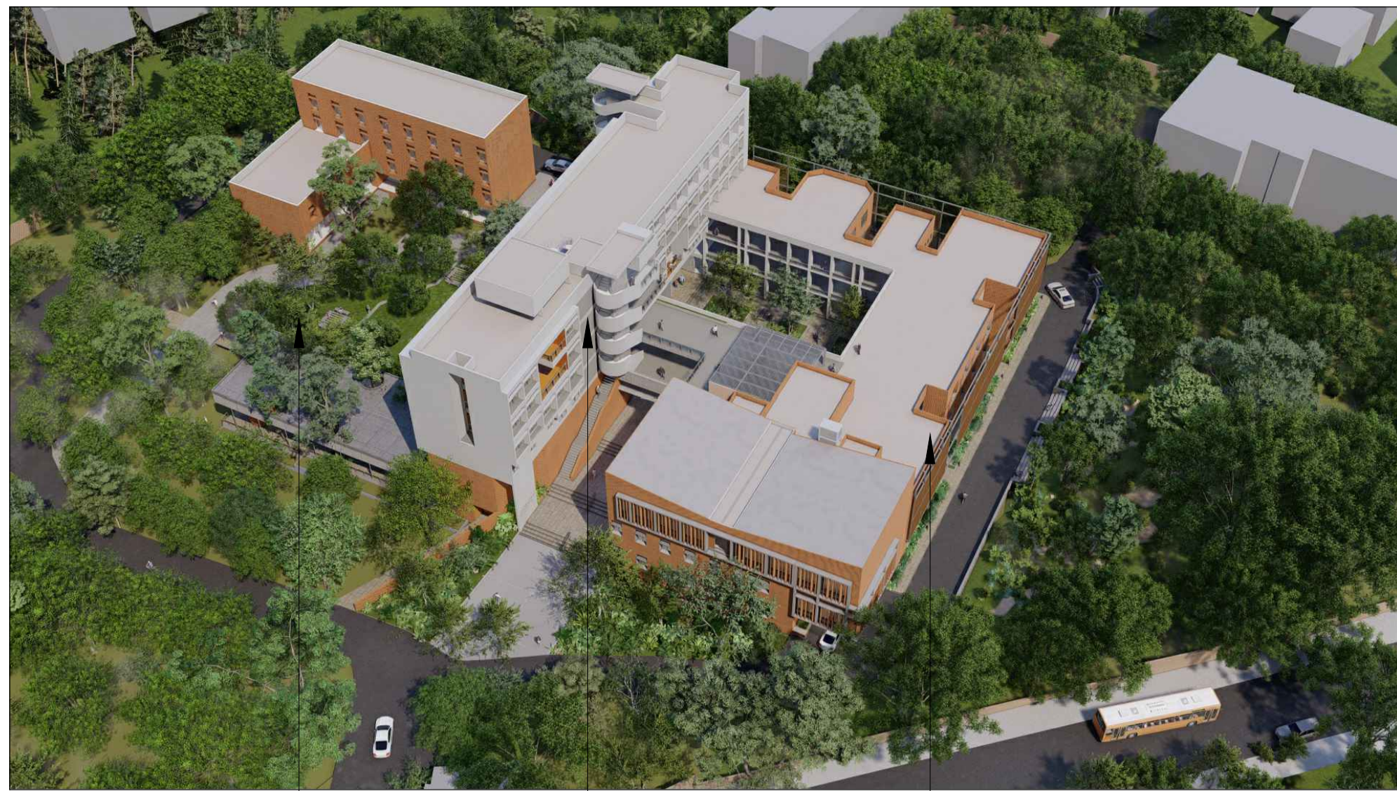
View A Quad New Faculty Block Old Academic Block