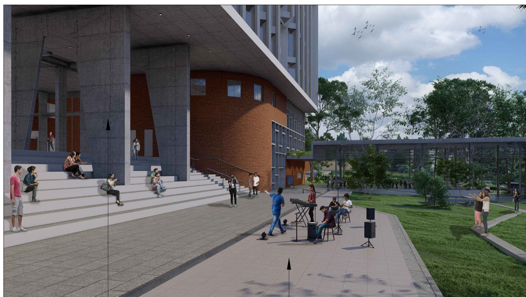
View C Exposed Concrete Portal External pathway