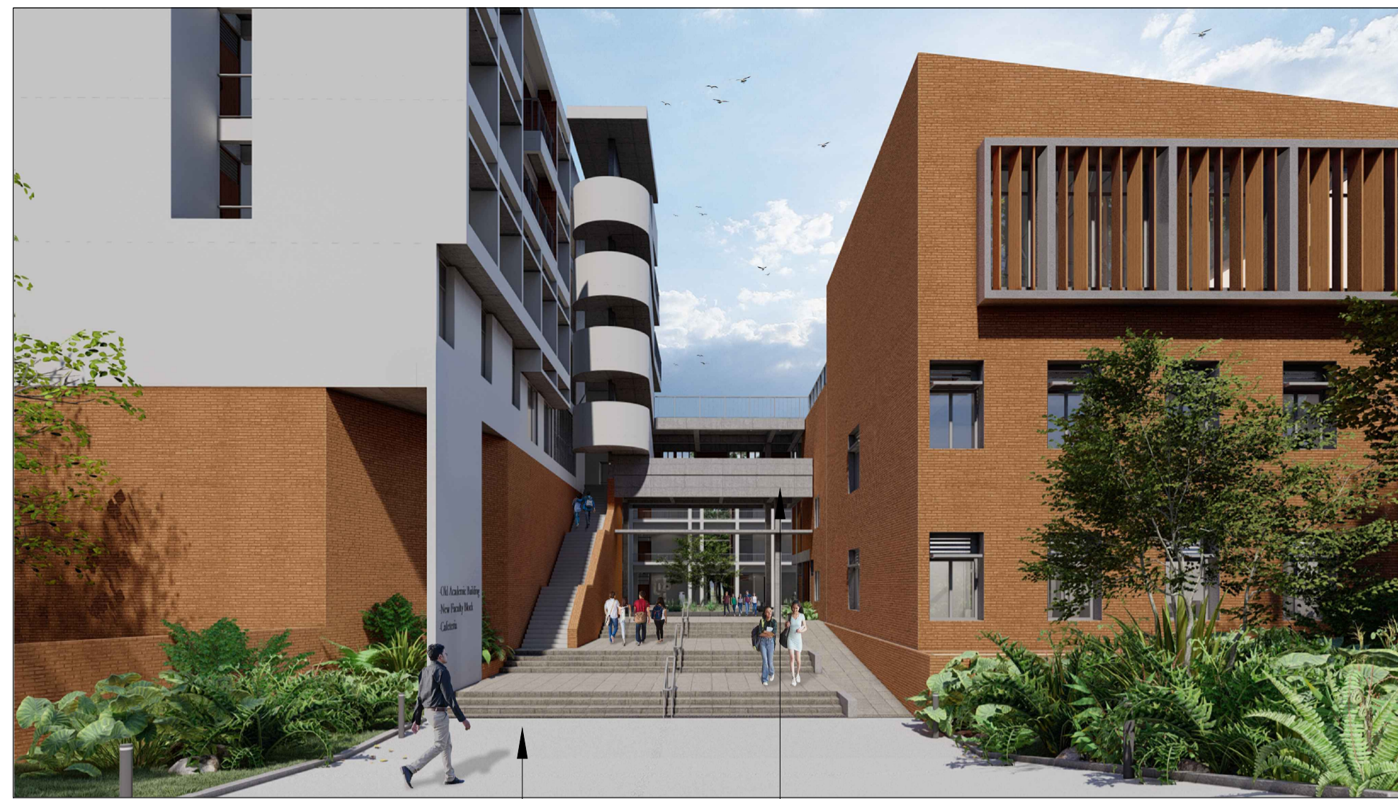
View D Entrance Connector