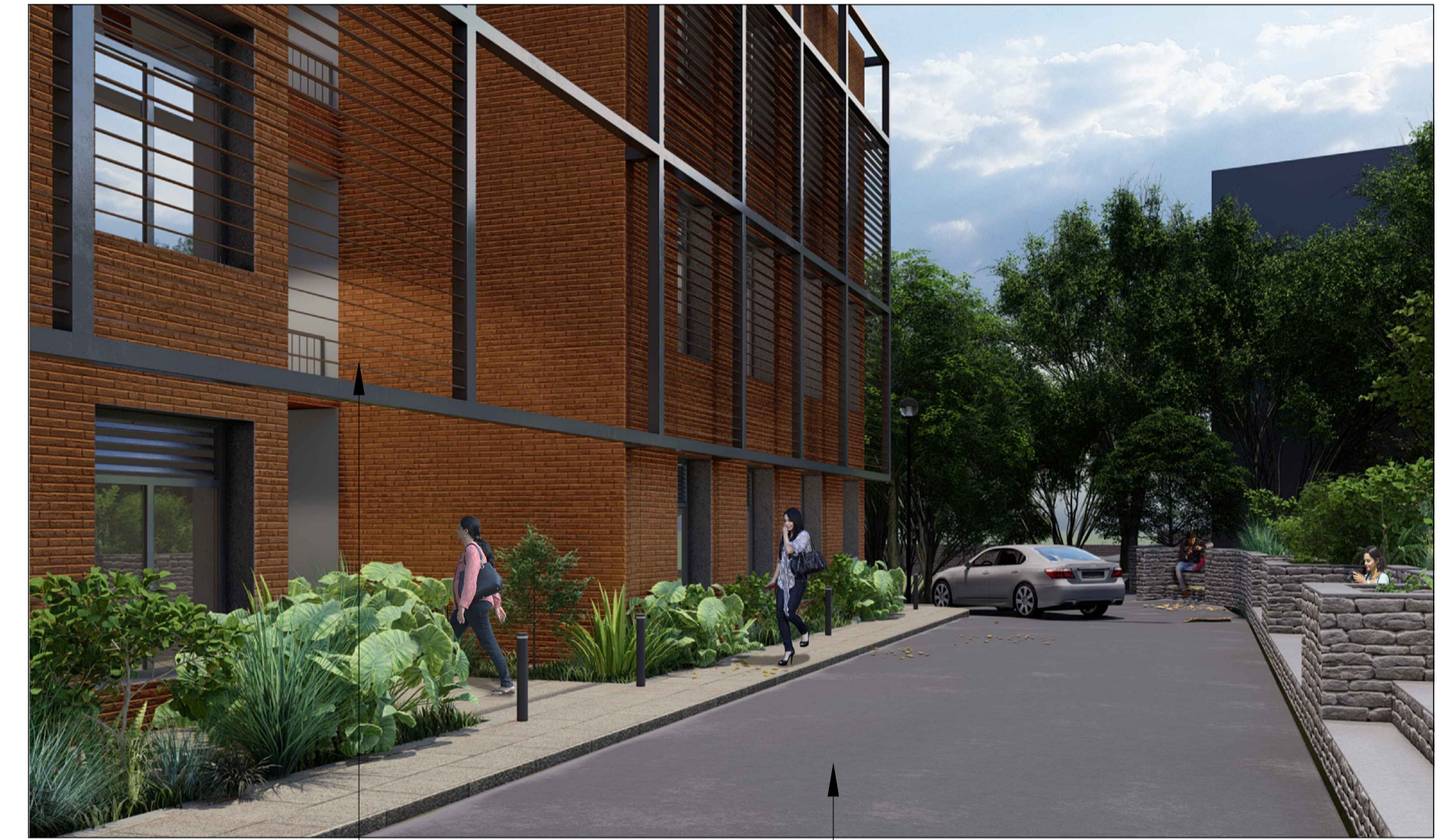
View H External Screen 6m Wide Road